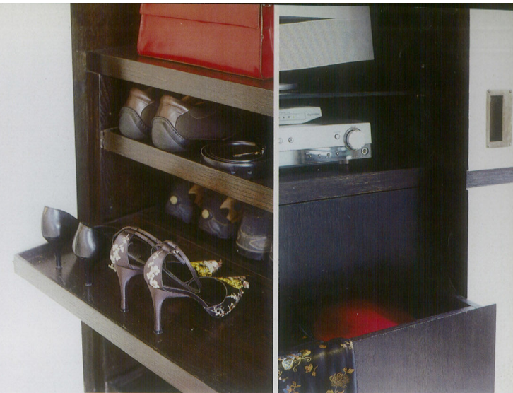
above Ample storage includes sliding shoe-trays built to specifically fit Isabelle's heels.