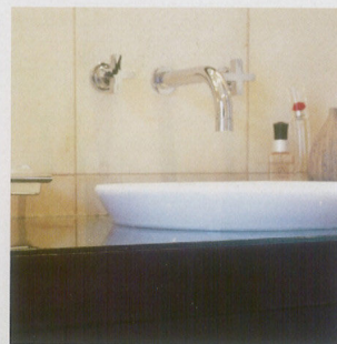
above and top right His and hers basins are unusually sunken halfway into the vanity unit and teamed with sleek, wall-mounted Barcelona taps.