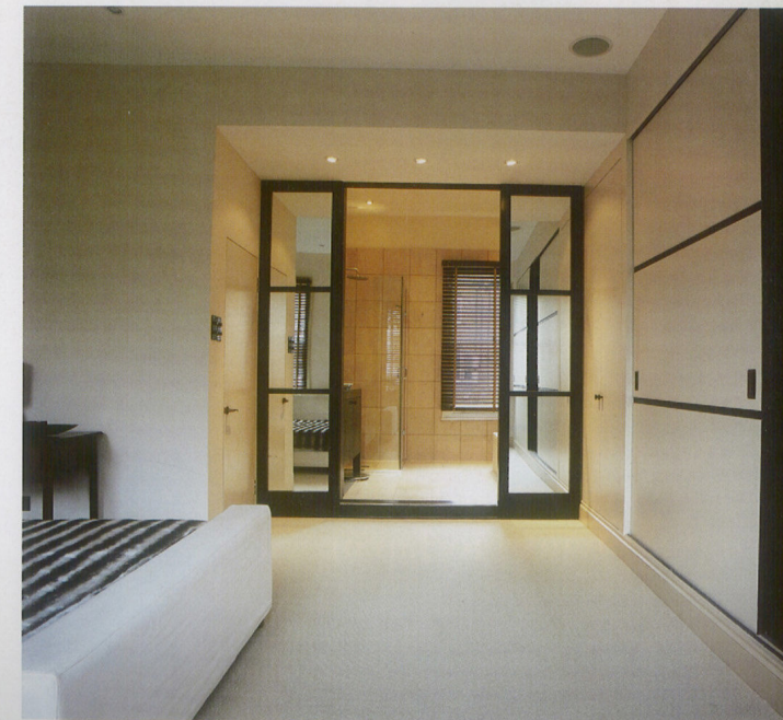
below Japanese-style mirrored doors act as a subtle divide, while bouncing light around the room.

displaying the different items we will bring back from our travels over the coming years." Paul and Isabelle bought their terraced London villa at the end of 2002. With its typical Victorian façade, standing anonymously in a street of fifty or so identical properties, it gives no hint from the outside of what might lie within. "The front betrays nothing of what we have done in here," agrees Isabelle. "It's only when you step inside that things are revealed to be completely different. The interior is modern, serene and a pleasant surprise for first-time visitors. I rather like that feeling of