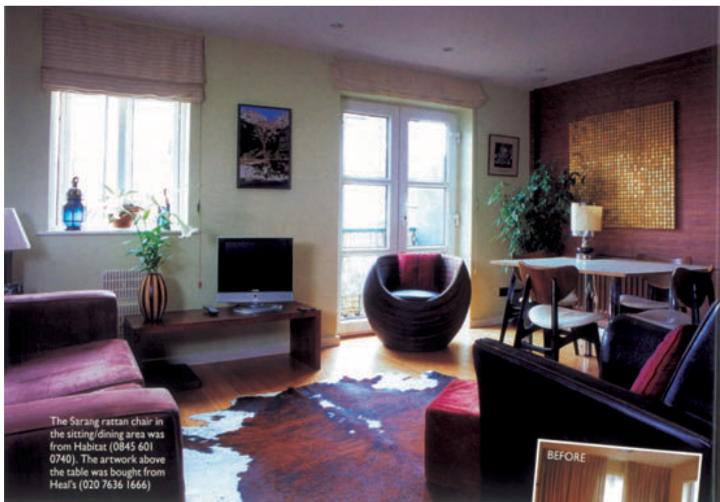
The Sarang rattan chair in the sitting/dining area was from Habitat (0845 601 0740). The artwork above the table was bought from Heal's (020 7636 1666)