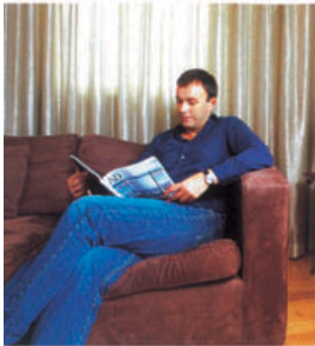
In the open-plan sitting room/kitchen, the sofa is from Sofa Workshop (01798 343400), while the dark-brown leather armchair was bought from littlebookof furniture.com. Oak units in the kitchen were stained to imitate wenge, while a large splashback area was covered in Madagascar mosaic tiles from Bisazza (020 8640 7994)